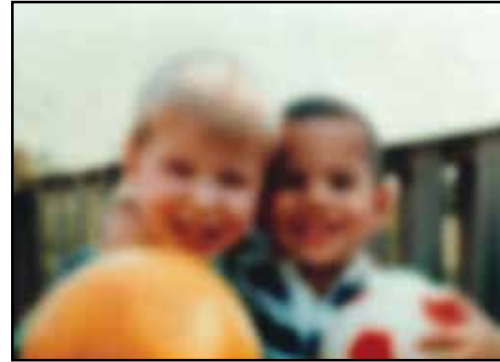
Same scene as viewed by a person with cataract.