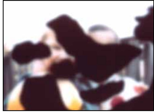
Same scene viewed by a person with diabetic retinopathy.