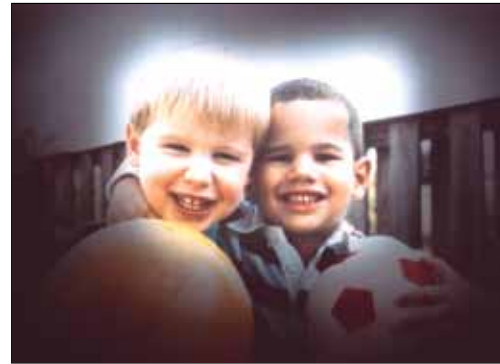
Same scene as viewed by a person with glaucoma.